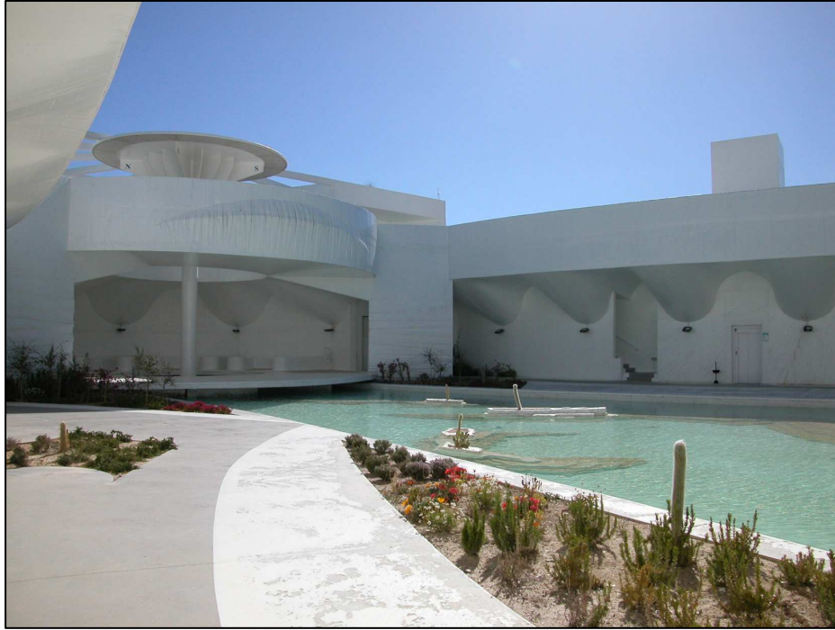
CEMACAM - the workshop venue